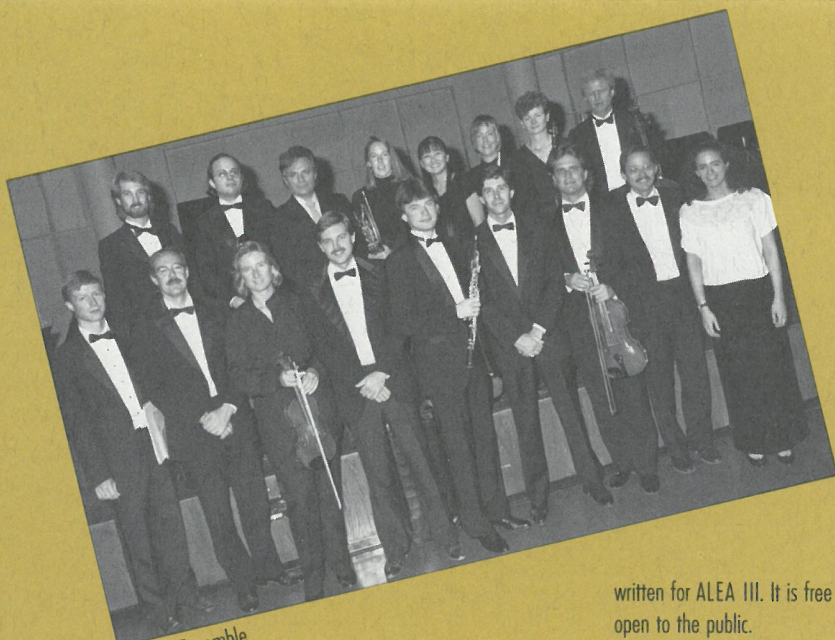
ALEA III Ensemble

Welcome to ALEA's twelfth season in residence at Boston University. After completing our sixth summer tour of Greece, we begin the season with the ALEA III International Composition Competition Finalist's Concert. The Finalists represent Argentina, Bulgaria, China, Great Britain, Greece, Italy, and the United States.