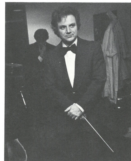
Theodore Antoniou music director

Derived from the Greek term meaning to roam, alea in Latin refers to "a die or dice used for playing at games of chance."